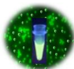
Fig.1 BcMag™ Terbium Fluorescence Magnetic Beads

BcMag™ Carboxyl-activated Terbium Fluorescence Magnetic Beads (Fig.1) are Time-Resolved Fluorescence (TRF) magnetic microspheres coated with a high density of Carboxyl functional groups on the surface. EDC and other carbodiimides are zero-length crosslinkers that cause carboxylates (-COOH) to conjugate directly to primary amines (-NH 2 ) without becoming part of the ultimate crosslink (amide bond) between target molecules. The microspheres combine the benefits of the preactivated Carboxyl active group, time-resolved Fluorescence dyes, and magnetic characteristics to perform very sensitive assays. The beads are manufactured using nanometer-scale superparamagnetic iron oxide and europium metal as core and entirely encapsulated by a high-purity silica shell, ensuring no leaching problems with the iron oxide and europium metal.